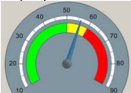
Total Support Staff Cost per Physician