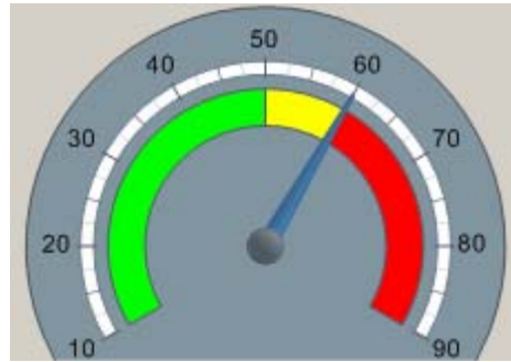
Total A/R per Physician